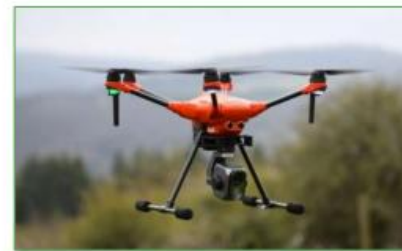
Germany (Gunda Lubek)